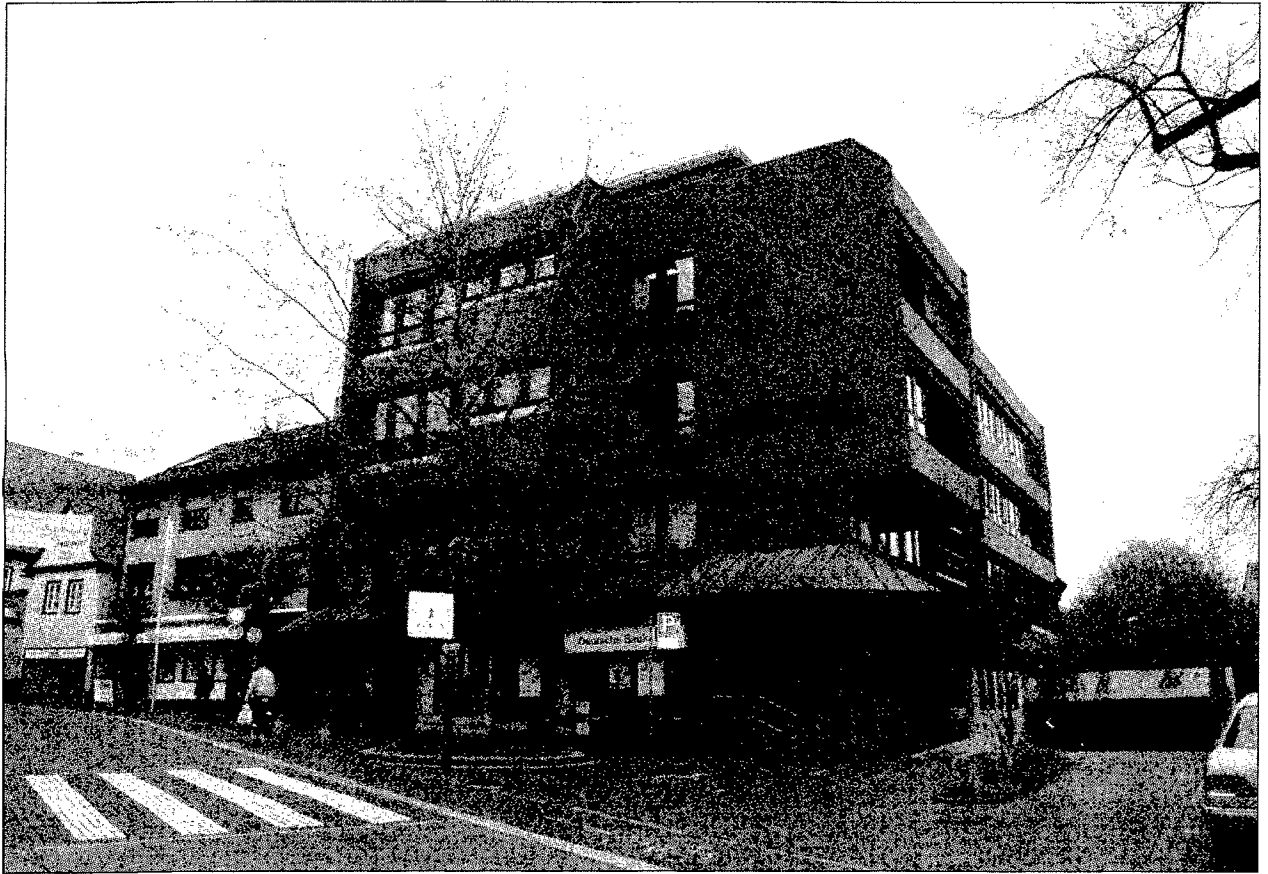
A multi-tenanted office and retail building investment of circa 26,000 square feet, worth €4.35 million in Sindelfingen, Germany, has been launched by Real Estate Alliance.

Headline: Second German investment opportunity launched by Real Estate Alliance